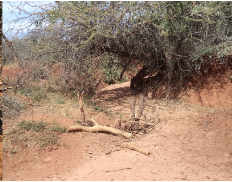
A pair of photos showing (left) an intact sieve structure and (right) the same structure destroyed by flooding in the heavy spring rains. All the branch packing, the large ballast logs, and most of the upright stubs have been washed away in the right photograph.