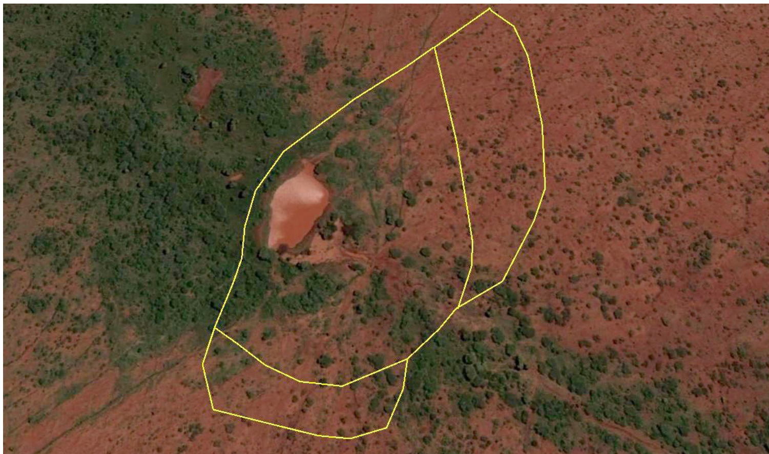
A Google Earth image showing the original fence outline at Dikale and the two extensions to the enclosure. Note the main gully running into the pond from the south-east, and a pair of secondary gullies that flow north, converge and join the main gully close to the pond. The main gully runs straight into the pond from a catchment of 0.5 km 2 and is the principal source of both water and sediment.

This is not a surprising result. No attempt was made to manage the head of the Dikale main gully system nor to control water flowing down its long straight length. Landscape ecologists from southern Africa, now working in Australia, emphasize the importance of