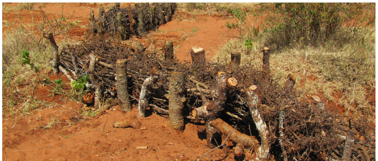
A pair of sieve structures at the confluence of 2 secondary gullies in the Dikale enclosure. The basic design consists of two rows of tree stumps sunk into the gully floor and packed with acacia branches. Some excavation has occurred in sand at the base of the sieve near the camera due to animal activity.

There are two essential components to managing the erosion problem: rehabilitating the landscape to control the source of soil loss, and reducing sediment flow through the gully system. Our project addressed both of these components. Another report describes the benefit of protection from livestock to foster revegetation of degraded landscapes that will hold soil in place and enhance rainfall infiltration. This report describes strategies and mechanisms to heal gullies and restrain sediment movement into ponds.